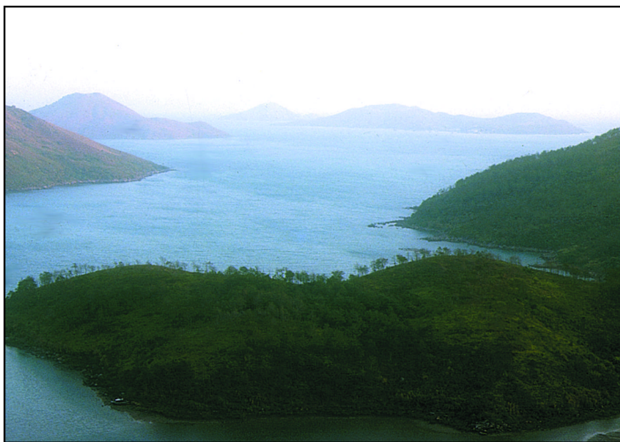
To Kwa Peng is one of two bays at the southern end of Long Harbor on the Sai Kung Peninsula. Like the bay at Hoi Ha Wan, its water is calm and clear and hosts a wide variety of flourishing marine life.

PHOTOS BY THE AUTHOR UNLESS OTHERWISE STATED