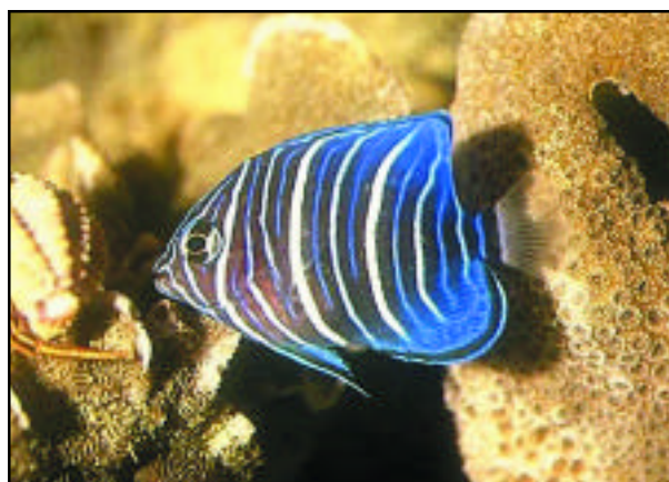
The striking colours of this juvenile Blue-ringed angelfish ( Pomacanthus annularis ) make it easy to spot underwater. Even from a distance, it stands out against the backdrop of its coral environment.

spawn. Three separate species of butterflyfishes could be seen grazing on the coral polyps. Anemonefishes were present, playing among the tentacles of their anemone hosts; and a myriad of nudibranchs, sea stars, cowries and sea urchins could be seen. In terms of the fish, their numbers were small by comparison to other reefs but it was a start. This area had been made part of a larger country park and it seemed therefore, that these animals would be allowed to live and grow at least for a while. And this was where I was headed as the bus trundled towards Sai Kung!