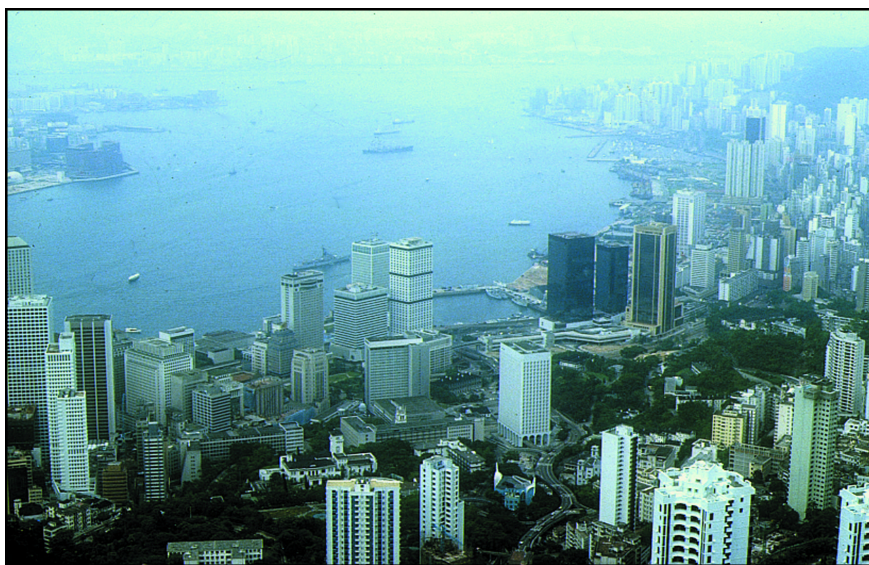
In 1841 Lord Palmerston, the then British Foreign Secretary, contemptuously dismissed Hong Kong as "a barren rock with hardly a house upon it." Nowadays, it is one of the world's most important trading centers. Victoria Harbor is one of the busiest in the world.

The shape of Hong Kong Island does not resemble a dragon, nor the Chinese character for wealth or anything like that. It is just a fragment, a scrap of bark chipped off the burl of China. And yet, when one flies in at night, especially coming in over the South China Sea, Hong Kong is the first thing seen after hours of darkness. And then one descends into a cavernous, bejeweled mouth and into the hustle and bustle of a vibrant city.