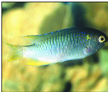
The Coral demoiselle, Neopomacentrus bankieri , is one of the most common damselfishes seen in Hong Kong waters.

I arranged to meet her the next day and took a PLB back to Choi Hung and the