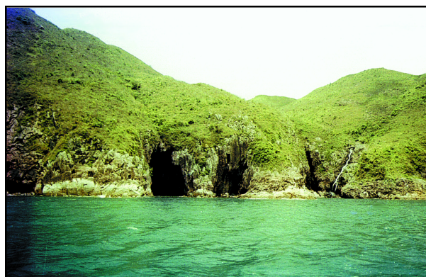
Har Mun Bay, at the Southern tip of Sharp Island. This deep-water bay is headed by a small waterfall that carries extra nutrients into the bay. The water is crystal-clear and many species of soft and leather corals make their home here, along with sea whips and Long-spined sea urchins ( Diadema setosum ).

do a quick survey of the area looking for changes in the ecology of the bay. I frequently returned to the boat to dry my hands and make notes. I noticed that there were many long-spined sea urchins on the seabed some 20 feet below and duck-dived down to dislodge one and bring it to the surface for identification. Since I was not wearing gloves, this was a tricky thing to do. Their needle sharp spines can produce painful wounds, although the chances of secondary infection are rare. To dislodge one from the substrate, I have found it best to take a single, larger, almost vertical spine between the thumb and forefinger and pull it very slowly sideways, until the tube feet of the urchin release their hold. At the surface I identified the sea urchin as Diadema setosum and released it watching it sink slowly to the bottom. Although there seemed to be a healthy growth of soft corals, urchins and sea whips in the bay, it was not the kind of marine environment I was hoping for. The water was clear with excellent visibility and I suspected that there had been no ecological changes since my last visit some years before. Encouraged by this, I climbed back into the walla-walla and dried myself.