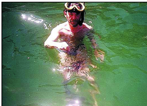
The author is seen here with the long-spined sea urchin brought to the surface from the sea bed in Har Mun Bay.