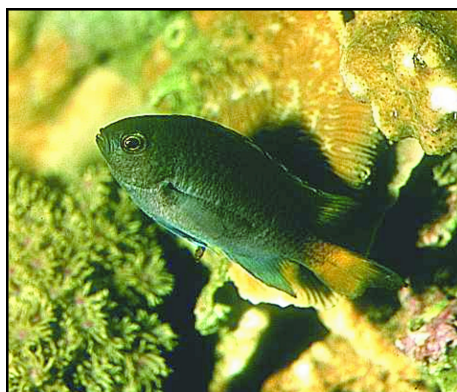
The similarly marked Regal demoiselle, Neopomacentrus cyanomos , is easy to identify because of its yellow tail.